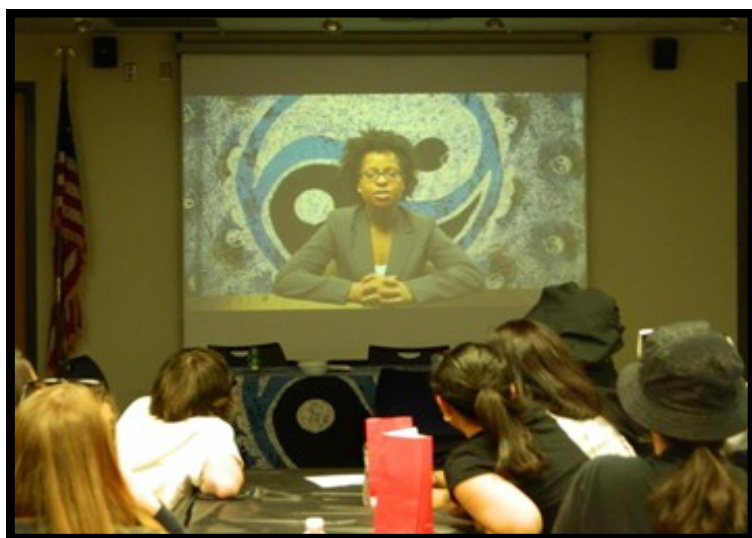
Photo from last month's Teen Movie Discussion

The teen movie discussion will take place on Wednesday, February 26 from 4:00—6:00 p.m. in the Community Event Room.