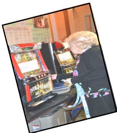
Scenes from 2012's Casino Night

The Vineland Library Foundation is holding a “Casino Night” at Vineland Public Library on Friday, September 19 from 7:00 – 10:00 p.m. Tickets for the event will be available soon. The cost will include hors d'oeuvres, play money for casino games and three hours of play at Blackjack, craps, roulette, poker and other games, plus a chance to win prizes! Come out and support your library and enjoy hours of fun and entertainment! For more information, contact the Administration Department at (856)794-4244 ext. 4732.